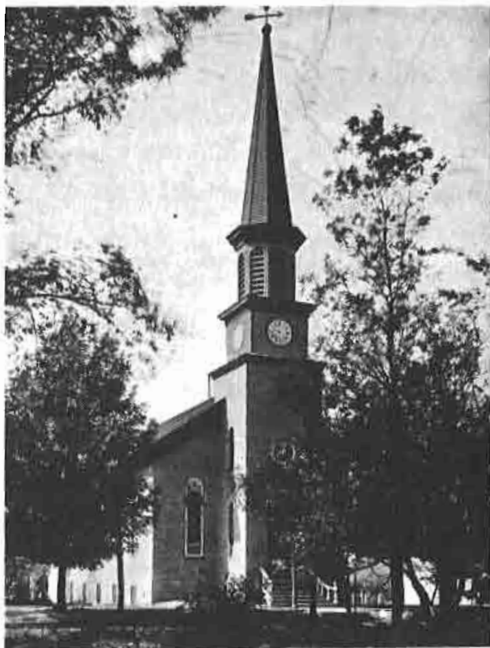
Church in 1890

many changes in pastorates, the weakening through division, and debts, had discouraged the members so that everything depended on the right man. The results of his faithful service did not fail to appear. When after 30 years it became necessary for him to relinquish his position, he turned over to his successor a congregation of over 300 families, free from debt. When called to the triumphant life above on November 7, 1911, not only the congregation, but the entire community felt his loss keenly.