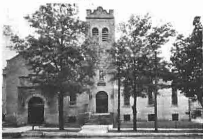
Church in 1926